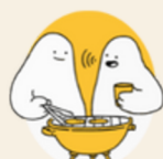
4. Check in