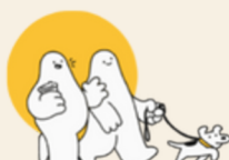
3. Encourage action